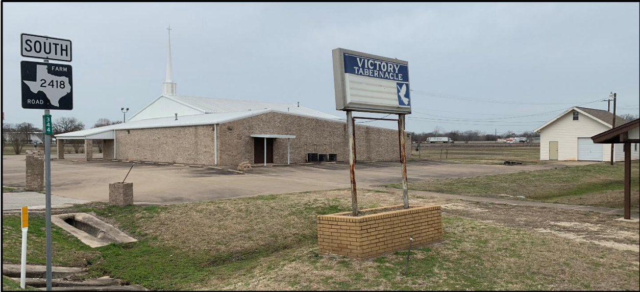
2220 Air Base Road Victory Church