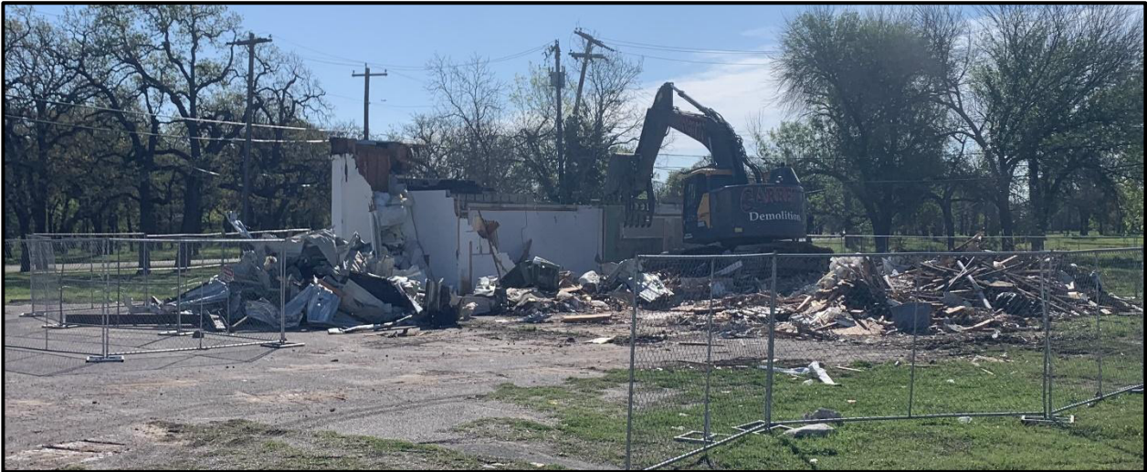
2233 Air Base Road Mosque (After)