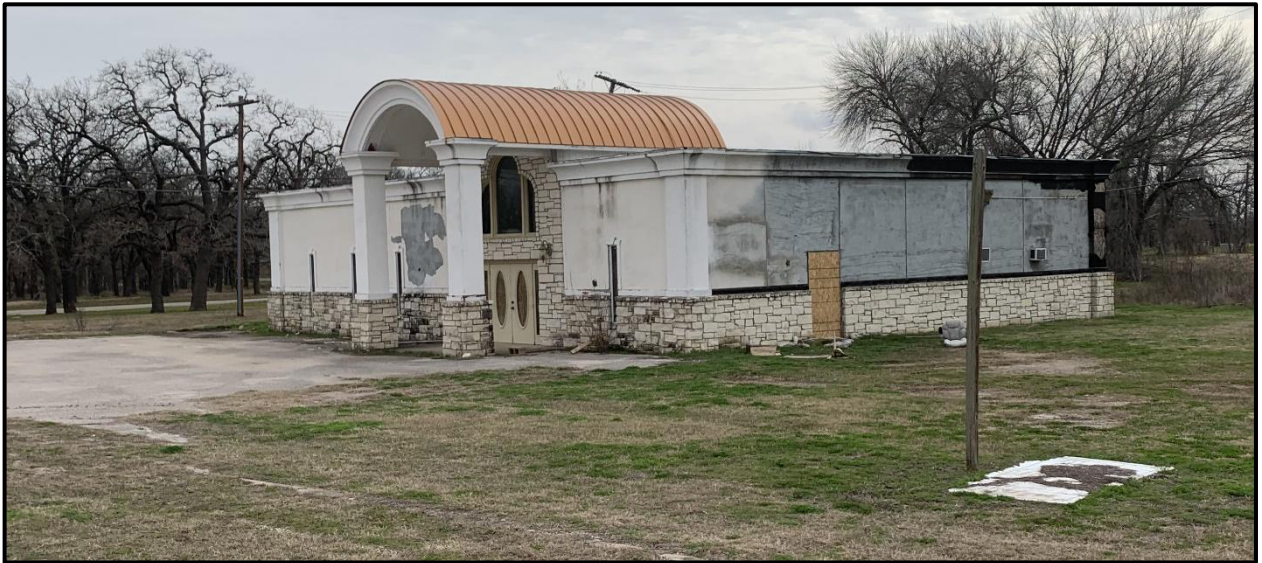
2233 Air Base Road Mosque (During)