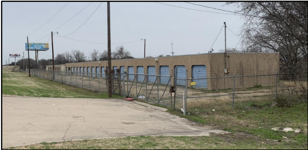
6315 North IH 35 254 Storage (During)